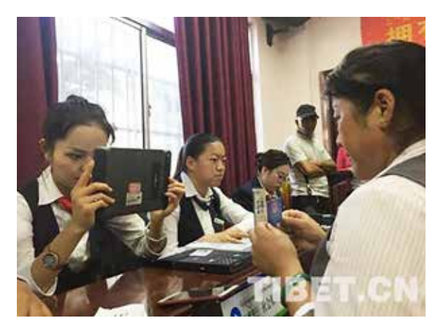
Social security cards have already been distributed to inhabitants of a number of Tibetan cities, including in Lhasa since August 2018.

CHINESE AUTHORITIES ACROSS THE TIBET AUTONOMOUS REGION (TAR) ANNOUNCED THIS SUMMER THE ROLLOUT OF SOCIAL SECURITY CARDS, PROMPTING FEARS THAT THESE COULD BE USED TO STRENGTHEN THE GRIP OF THE COMMUNIST PARTY-STATE OVER TIBETANS' LIVES.