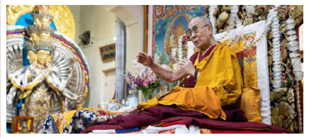
The Dalai Lama at a Long Life Ceremony in the main temple in Dharamsala, India, on 5 July 2019.

CHINESE COMMUNIST PARTY AUTHORITIES HAVE STEPPED UP EFFORTS TO CONTROL THE SUCCESSION OF THE DALAI LAMA, BY HOSTING THEIR FIRST MAJOR TRAINING ON REINCARNATION INVOLVING MONKS FROM PROMINENT TIBETAN MONASTERIES.